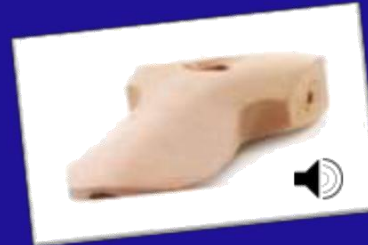
SAMBA WHISTLE – 'APITO'