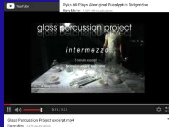
Glass Percussion Project excerpt.mp4 Estate Miles · 1,409 views

https://m.youtube.com/watch?v=zYrKyvQyVkM